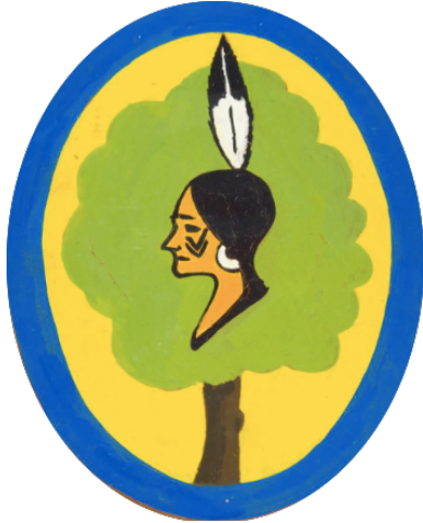
22 Photographic Squadron emblem