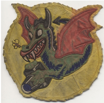
22 Photographic Squadron emblem