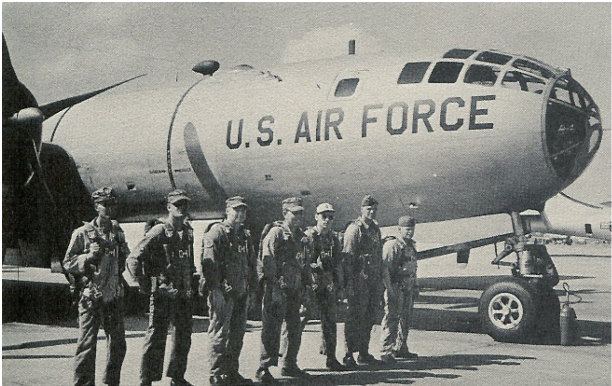
Flight crew ready for inspection, England AFB, LA, 1955.