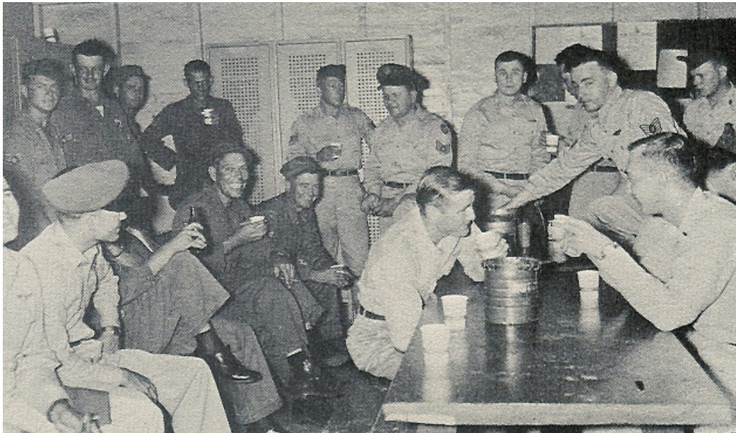
Taking a break the Coffee Shack behind Operations, England AFB, LA, 1955