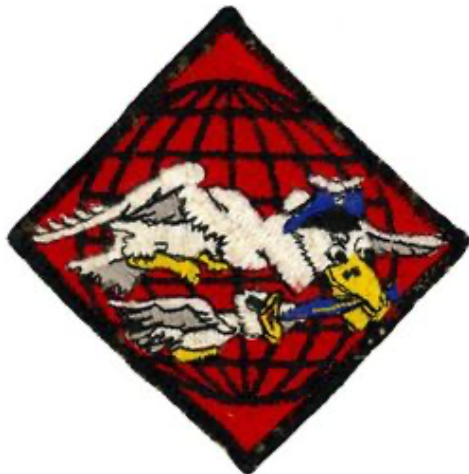
622 Air Refueling Squadron emblem: A caricatured pelican feeding a baby pelican a fish, superimposed on a globe. (Approved, 15 Jun 1956)