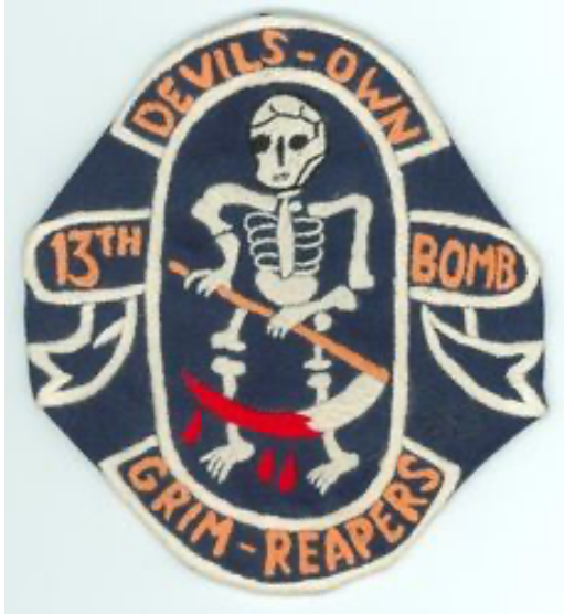
13 Bombardment Squadron, Tactical