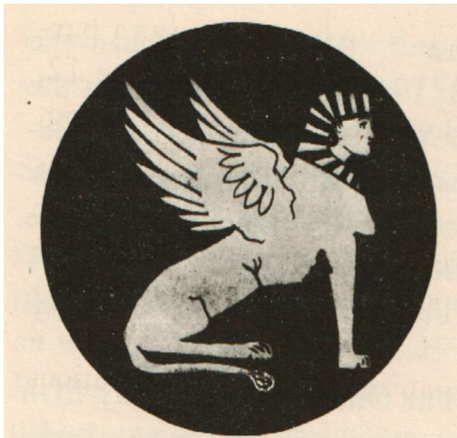
One Hundred Fourth: Insignia: Figure of winged sphinx, placed in a large circle.